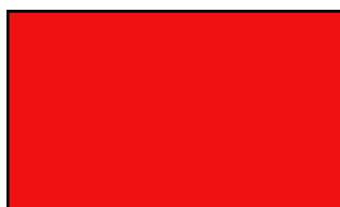
Tinting Shade (1:25)